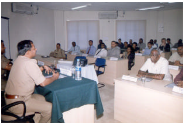
Visit of Foreign Police Delegation