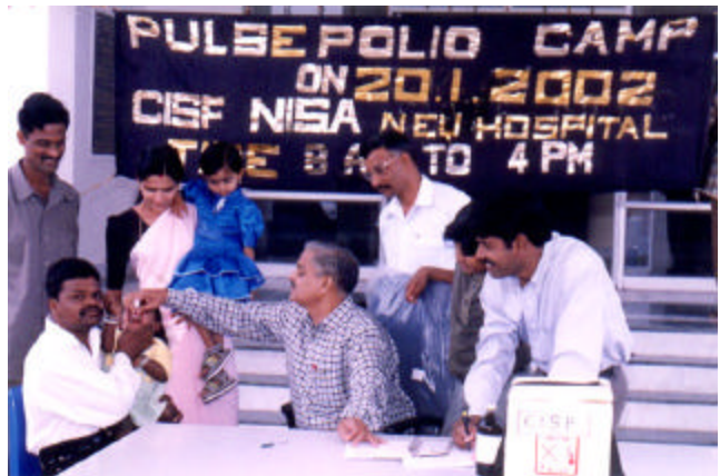
Middle (Right): Pulse Polio immunization program