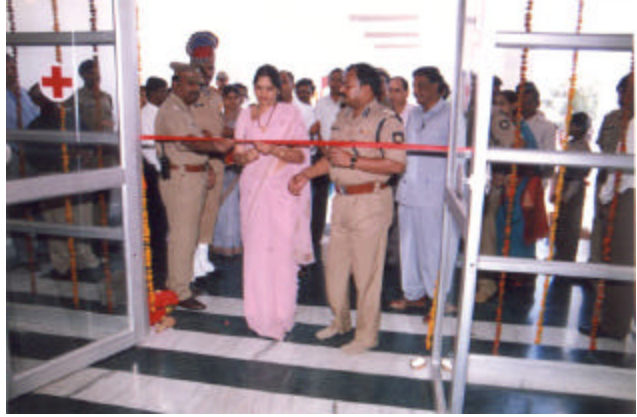
Inauguration of Hospital by President, Welfare

The above facilities will go a long way in augmenting the training infrastructure of the Academy.