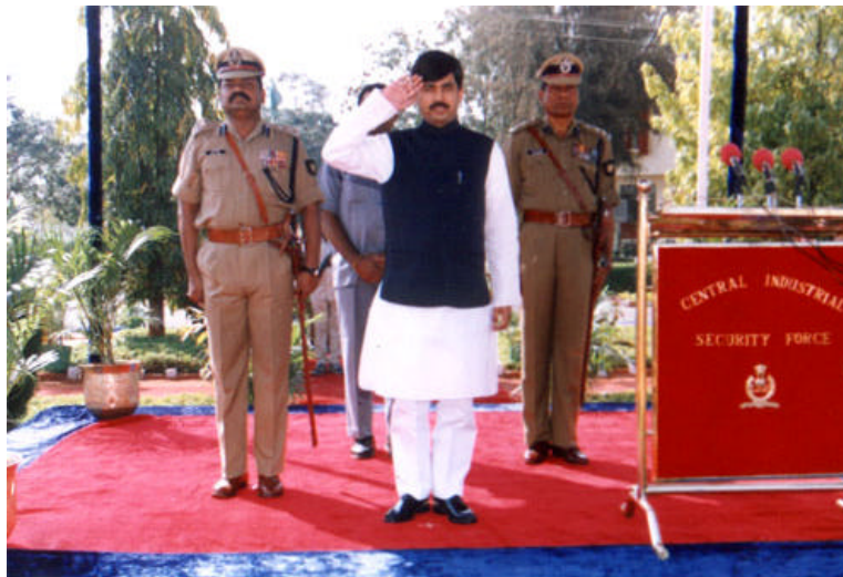
Shri Syed Shahnawaz Hussain, Honorable Union Minister for Civil Aviation taking salute at the parade