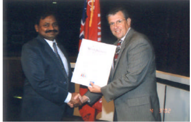
Above (Right) : DIG NISA with Mayor of Baton Rouge, Louisiana State