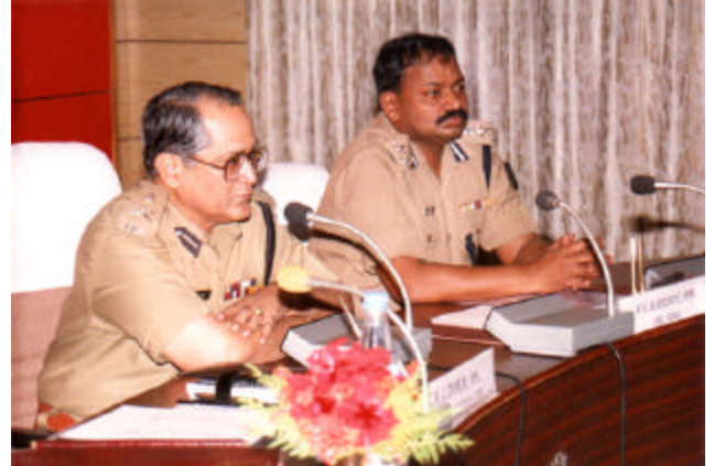
DG, CISF interacting with PPC Participants