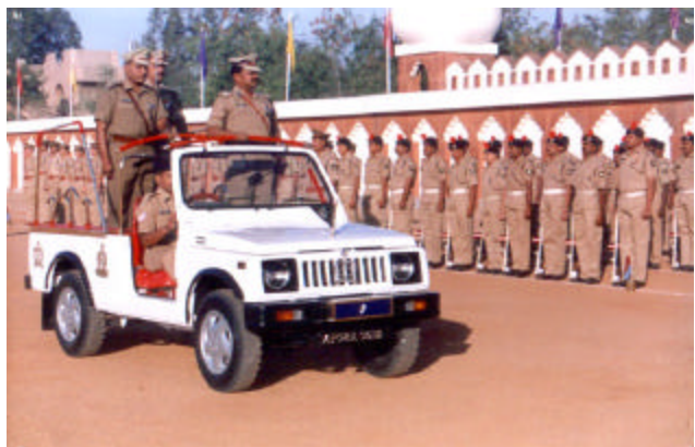
Republic Day Parade at NISA